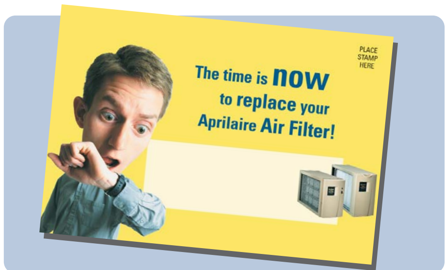
Available Now! The newly designed reminder postcard for Genuine Aprilaire air cleaner media. Ask your District Sales Manager about our reminder program.