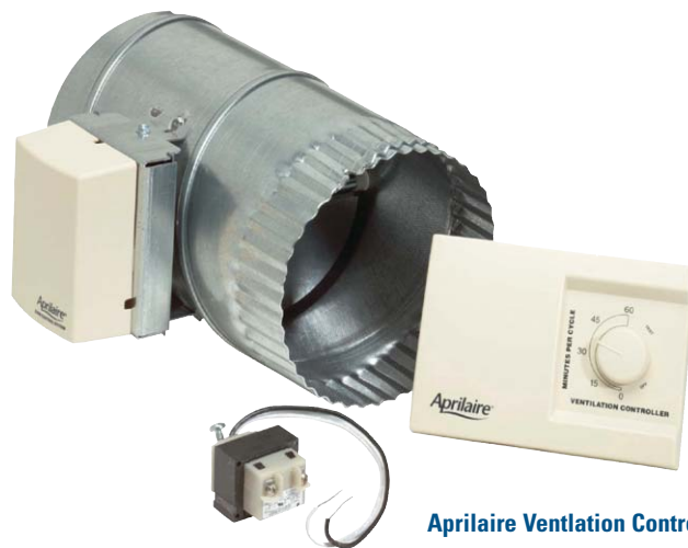
Aprilaire Ventilation Control System Model 8126

able points today. By including the Ventilation Control System as standard in newly built homes, your builders can not only bring all the benefits of fresh air in the home and improve indoor air quality, but they can gain valuable Energy Star and Green Build points at an economical price. ■